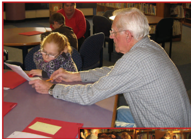
After-School KAMP (Kids Academic Mentoring Program)

The Circuit Court - Family Division is an Equal Opportunity Employer.