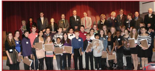
Youth Recognition Awards Ceremony